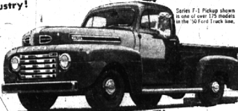
Series F-1 Package shown with 175-hp. engine in the '50 Ford Truck line.