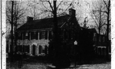
LONE PINE COURT

The finest residential environment possible... near Cranbrook, Kingwood and Brookside Schools... and Christ Church. A superbly built Colonial... fieldstone and shingle... a beautifully wooded 1/2 acre setting... a quiet, secluded lane... convenient to bus transportation.