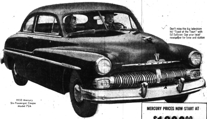
1950 Mercury Six-Passenger Coupe Model 72A