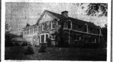
above the Pool

Interesting and unique, this fieldstone and brick Colonial built into the hillside above a large reflecting pool. One floor ranch home as you approach it. . . two full floors from the garden and pool side. Over an acre . . . a separate workshop or guest house.