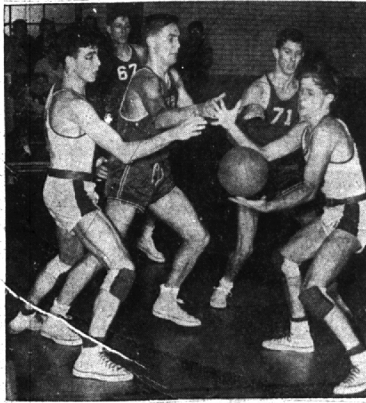
PLAYERS GRAB FOR BALL Grand Rapids Union edged Maples 53-45

Southfield Appeals Board to Meet Tuesday, Jan. 2