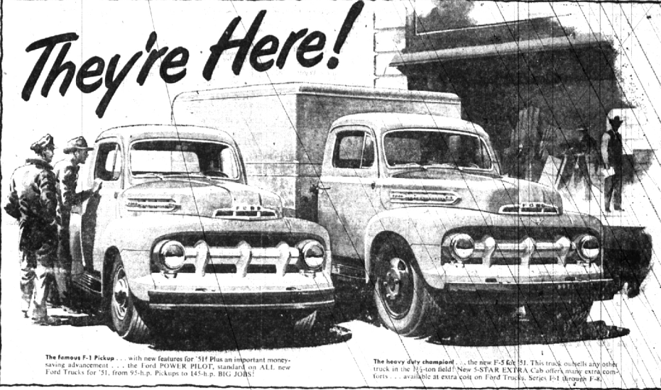
The famous F-1 Pickup... with new features for '51 Plus an important money-saving advancement... the Ford POWER PILOT, standard on ALL new Ford Trucks for '51, from 9-5-h-p. Pickups to 145-h.p. BIG JOBS!

USE THE ECCENTRIC WANT ADS FOR BEST RESULTS