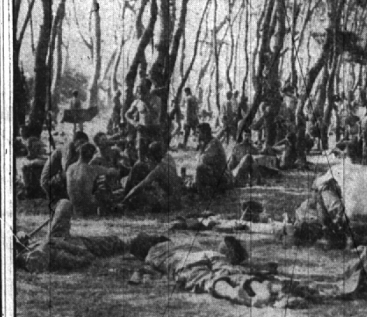
BETWEEN ROUNDS—U. S. Marines on the front lines in South Korea are shown taking time out between enemy assaults to catch up on badly-needed rest.