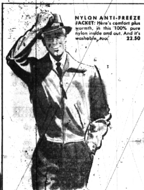
NYLON ANTI-FREEZE JACKET: Here's comfort plus warmth in this 100% pure nylon inside and out. And it's washable, too. $2.50