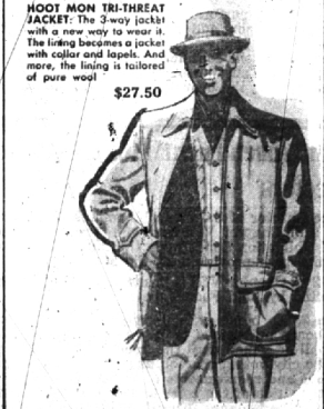
HOOT MON TRI-THREAT JACKET: The 3-way jacket with a new way to wear it. The lining becomes a pocket with collar and lapels. And more, the lining is tailored of pure wool. $27.50

DREZZLER GOLFER: Here's the jacket that hugs your hips snugly, yet comfortably, no matter how you twist or squirm. A wind and water-repellent nylon proportional blend. 10.95