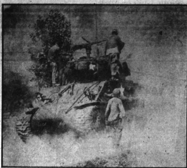
DUSTY DREADNAUGHT —The foot soldier at right finds himself about to be enveloped by the swirling cloud of dust kicked up by an American medium tank racing for the South Korean front. To the two G.I.'s clinging to the Sherman tank's turret, dust and battle smoke are old stories.

News copy submitted early necessarily is given preference over late items. The "early bird" usually gets the space.