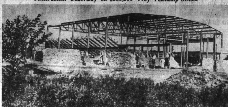
STEEL FRAMEWORK UP FOR GYMNASIUM, FIRST UNIT TO BE WORKED ON