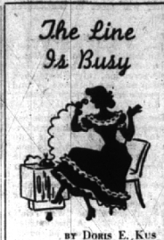
From the BBDO News Bureau, 383 Madison, New York City, comes a release which carries a startling headline: "Are You the Girl Jon Whitcomb is Looking For?" Well, now, I wouldn't say that! The show has, underneath this soul searching interrogation, five portraits of very charming young ladies (fashion designer, gals, they've all got short hair) surrounding none other than Mr. Whitcomb himself. The dashing hunk of mankind is say the least. The gentleman is holding one of his drawings and seems to be glancing over his shoulder as if looking "For You?"