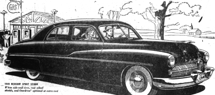
1949 MERCURY SPORT SEDAN White side-oval tires, rear wheel shields, and Overdrive* optional at extra cost