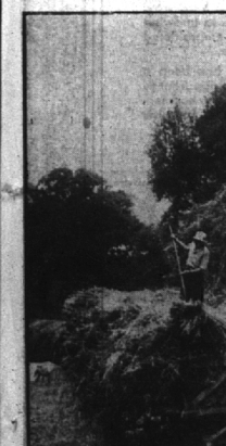
HOPE FOR TOMORROW—Marking one of the earliest harvests on record in England, farm workers stack the wheat high in readiness for thrashing on the Appleby Farm near Bedford. With good crops, life in England may be less austere.