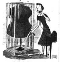
"Is this the Match-Your-Figure Company? There must be some mistake!"