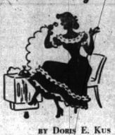
BY DORIS E. KUS

Take the case of the smart, snarling and disparaging "woman driver!" Seems as if when a man can't think of anything else to crab about he reverts to the subject of us women and our conduct behind the wheel of a car. Sometimes the accusations get me awfully riled up.