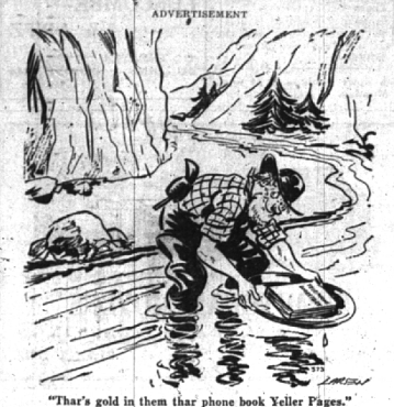
"That's gold in them thar phone book Yeller Pages."

Located on East Side of Dixie, 1/2 Mile South of Waterford FINEST UPHOLSTERING Our twenty-six years in Pontiac is your guarantee of satisfaction. Our upholstering craftsmen and experienced tradesmen qualified to refinish and reupholster, if necessary, your most treasured pieces. Reupholstered furniture may also be refinished in our complete cabinet and finishing department. Slight additional charge for refinishing. Our material and fabric selection is complete. CUSTOM MADE FURNITURE 5390 Dixie Highway Phone 3-2641