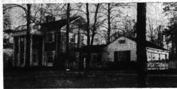
In Woodcreek Farms . . . Franklin Hills

A lovely home . . . three Bedrooms and two Baths . . . on 4 1/2 acres of rolling land. Close to Northwestern Highway . . . a direct route into Detroit . . . only a 45 minute drive . . . bus to schools.