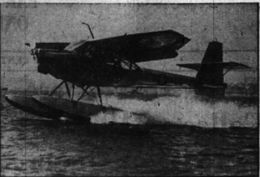
DOES EVERYTHING BUT COOK —Most versatile plane in Uncle Sam's air arsenal is this all-metal Convair L-18, skimming over San Diego Bay in its first water test. The all-purpose craft is slated for use for observation, communication, artillery spotting, supply-dropping, cargo transport, photographic and rescue missions. In addition to standard landing gear and floats, it can be equipped with ski-wheels for snow operations and double wheels for desert missions. Wings and tail fold for ease in towing or storage.

all you need for perfect pictures BLACK AND WHITE OR COLOR argus C3