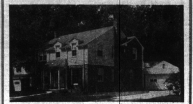
693 N. GLENHURST

You will experience a feeling of complete contentment as you drive this quiet, tree-lined street. You will find, too, a feeling of serenity as you go through this lovely Colonial home.