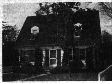
Near Quanton School

A charming home . . . nearly in the shadow of Quanton School . . . a third of an acre of land, beautifully landscaped . . . spotless condition . . . carpeting, aluminum storms and screens included . . . ready to move into without expense . . . this is the home you should see today!