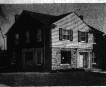
In Bloomfield Village

A charming new brick Colonial . . . in the Quanton School district and the best part of Bloomfield Village . . . attractively decorated . . . the owner transferred . . . ready for occupancy. A new home, carpeted and landscaped, for less than the cost of building . . . this is a real opportunity to buy where you want to live.