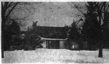
Near Christ Church

One of the most convenient locations in the Hills is Lone Pine Road—between the Church and Woodward. Close to transportation for servants, secluded and rolling... and all the benefits of the Church and School developments. The attractive home pictured above is one of the most picturesque in the area.