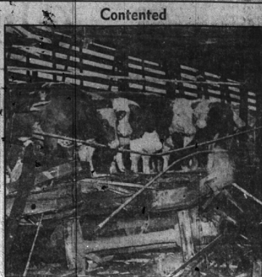
Standing in a wrecked stock car, these cattle seem as contented as they were out in a pasture. Two crew members were injured when the stock train collided with a freight train at a crossover of the Santa Fe and Indiana Harbor Belt Railroads in Chicago.