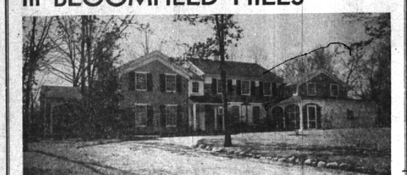
near Cranbrook School

PERFECT for a large family . . . perfect in design, construction, floor plan, appointments, location . . . everything that makes a home a place of fond memories . . . a happy home.