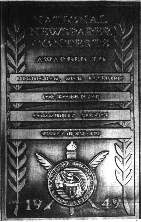
This bronze plaque was awarded Saturday night by the National Editorial Association to the Birmingham Eccentric for its service to the community last year.