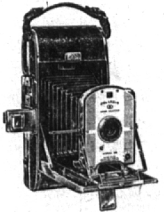
Permanent pictures . . . from a guaranteed camera . . . in 60 seconds.

You snap the shutter—then lift out your finished picture a minute later. Yes, it's as simple as that to use the amazing new Polaroid Camera. No liquids . . . no dark room . . . no fuss—the camera and film do all the work.