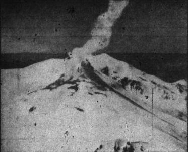
BIRTH OF A VOLCANO —Steam rising from a snowcapped mountain in South America indicates the discovery of a hitherto unknown volcano atop Cerro de Parícuta, a peak rising to a height of 20,000 feet, exactly on the border between Bolivia and Chile.