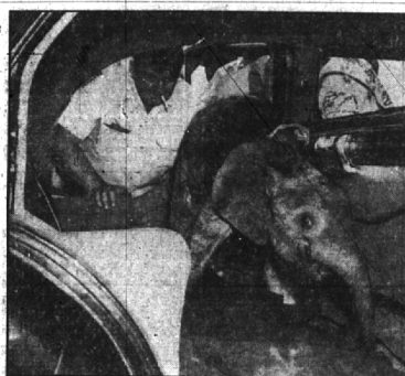
TRAVELING IN STYLE —Dumbo gets a helpful hoist as he climbs into the back seat of a car on his arrival at New York's LaGuardia Airport, after a plane trip from Africa. Dumbo weighs a mere 700 pounds. But give the little fellow time—he's only a year old. He's on the way to his new home in the St. Louis Zoo.

NOTICE OF SALE $1,500,000 IN TOWNSHIP DISTRICT OF SOUTHFIELD TOWNSHIP OAKLAND COUNTY, MICHIGAN SCHOOL BUILDING BONDS