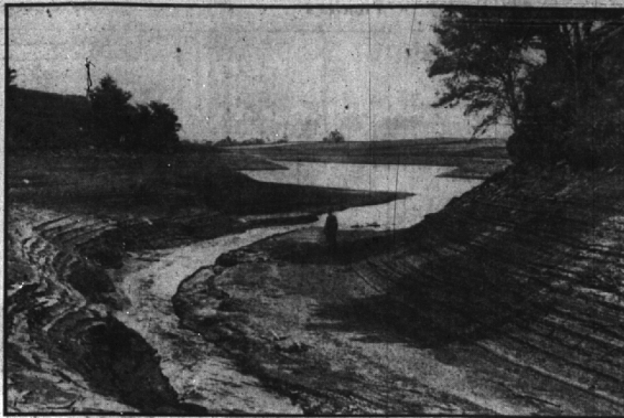
NOW THAT SUMMER'S HERE —England, too, has been affected by the driest summer in many years. Her crops are in danger of drying up from lack of rain. The sinking level of this reservoir in Baldersdale threatens that section's water supply. It's already 350,000,000 gallons below normal level. The spot in which that man in center is standing would ordinarily be covered over with 14 or more feet of water.

Information concerning church services, free public lectures, and other Christian Science activities also available.