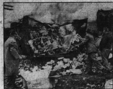
GAS MASKS GO UP IN SMOKE —A Chicago war surplus dealer adds a few more "white elephants" to the fire as he burns two million new gas masks, which originally cost the government $6,500,000. The dealer bought the masks for five cents each, but was unable to sell them. They were originally purchased by the government for the wartime protection of civilians.