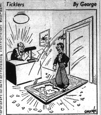
"You advertised for an aggressive office boy?"

REWARD LOST large female collie 8 yrs. old