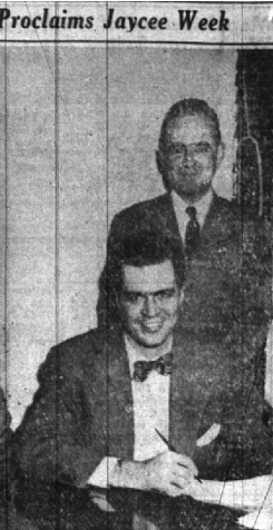
Governor C. Mennen Williams signs a proclamation designating this week (Jan. 14-21) as "Jayce Week" in Michigan and acknowledging the young men's organization for its "material contribution to the betterment of the state."

THE BIRMINGHAM ECCENTRIC Detroit Office: MAISON 2629 PHOENIX 4664