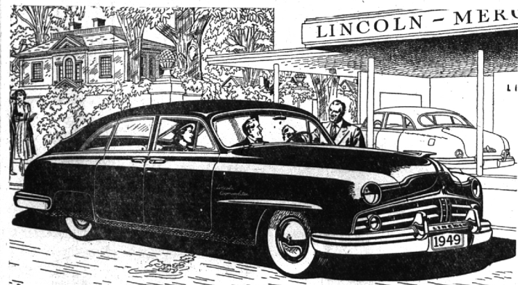
White side-wall tires and road lamps are optional.

GET BEHIND the wheel of a handsome new Lincoln Cosmopolitan as soon as possible... and we promise you'll discover a new measure of motoring pleasure far surpassing anything you've experienced before! Here is a fine car that's so luxurious you've got to see it—and drive it—to believe it! Its windshield is the widest on any fine car—a sweeping curve of one-piece safety glass almost five feet wide! Its interior is so luxurious that push-button windows are "standard equipment"!