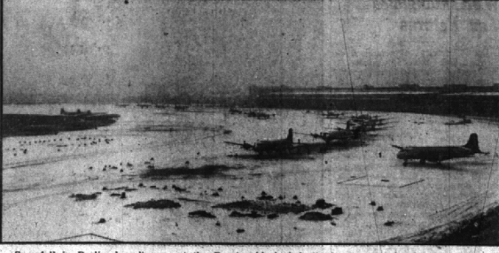
Snowfall in Berlin doesn't prevent the Russian-blockaded city from getting its share of food and other needed supplies. Tempelhof Airfield is crowded with planes, most of them airlift aircraft grounded only temporarily because of low ceiling. The supplies continue to pour in.