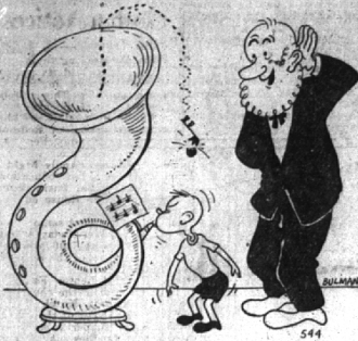
"This I shouldn't miss! I'll get my specs and the telephone directory and look up 'Hearing Aids' in the Yellow Pages."