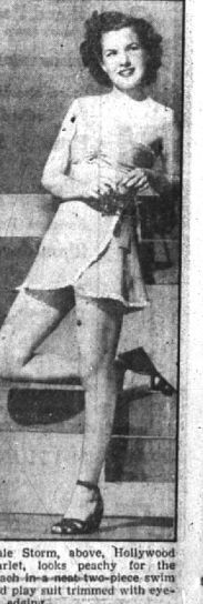
Gale Storm, above, Hollywood starlet, looks peachy for the beach in a new two-piece swimsuit and play suit trimmed with eyeliner edging.