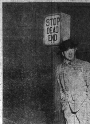
JOHN PAYNE portrays here his starring part in "Dead End", which will be broadcast this week on the radio series, GREAT SCENES FROM GREAT PLAYS, sponsored weekly by families of The Protestant Episcopal Church and the Episcopal Actors' Guild.