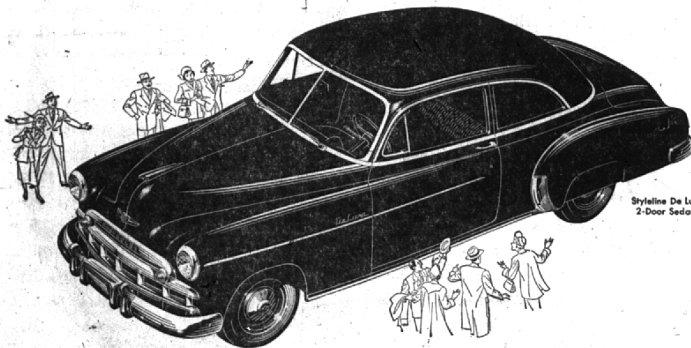
Styline De Luxe 2-Door Sedan

... in all these features and in all these ways!