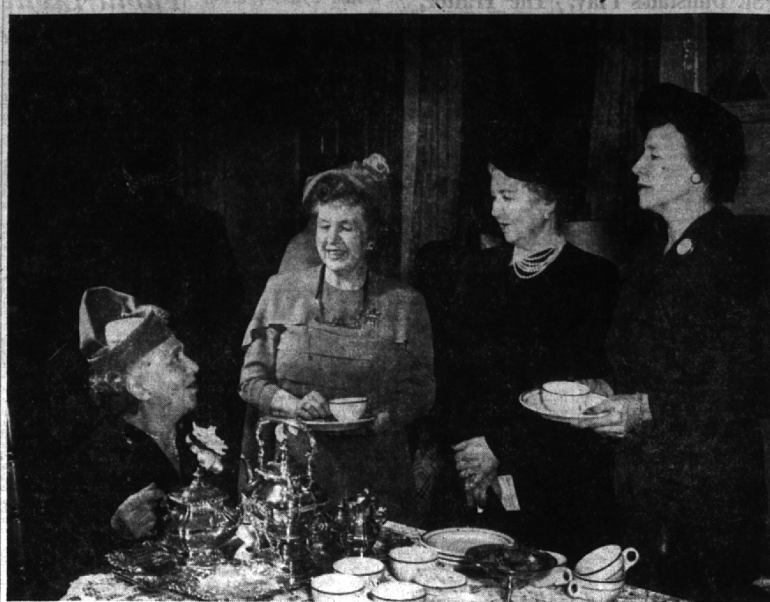
Last Thursday afternoon from 2:00 to 5:00 o'clock, the Birmingham Society of Women Painters held an exhibit and tea in the Community House. Portraits, landscapes and still lifes were shown by the 26 members of the organization.

Pictured above discussing the tea table arrangement