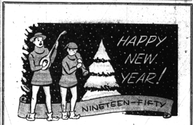
HAPPY NEW YEAR! NINETEEN-FIFTY