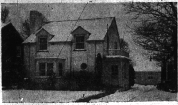
1825 Pine Street

What better present for the entire family than this attractive Colonial near Quarton School?