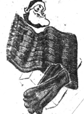
WOOL MUFLERS, SCARF AND GLOVE SETS

Wool flannels, wool gabardines and washable fabrics, from $3.95 to $15.95