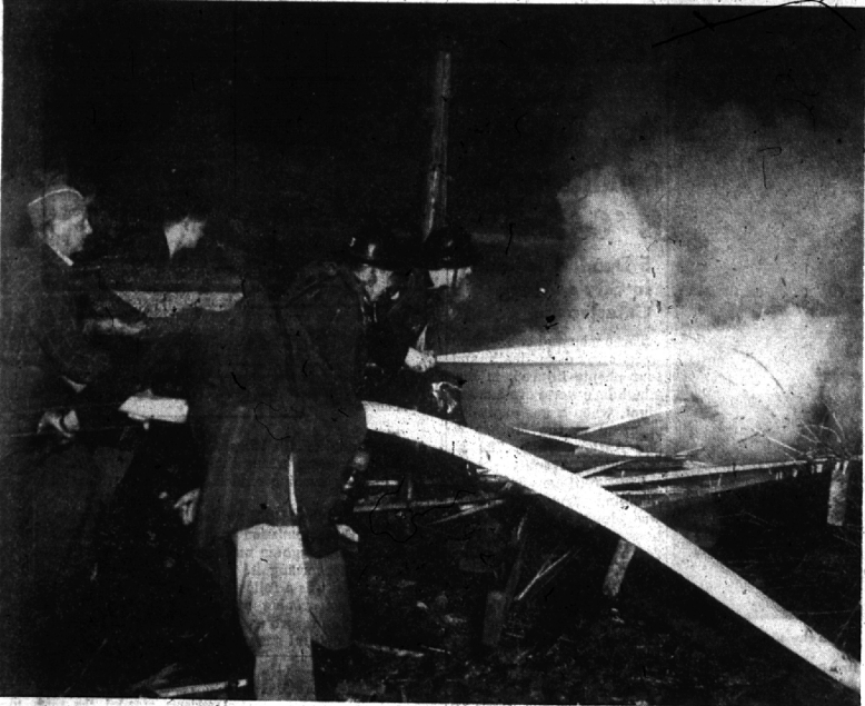
The above two photos, also taken by Joe Wheeler, show firemen battling to control the flames resulting from the explosion Sunday night at the Mother and Son Antique