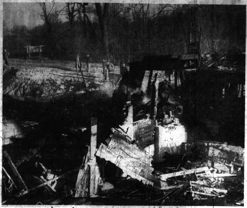
When daylight arrived Monday morning, the total destruction of the blast and fire were clearly evident