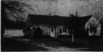
all brick . . . all on one floor

Artistic and unusual . . . just right for a small family . . . all brick, one-floor design . . . Quarton School area . . . a view over rolling fields to the stream.