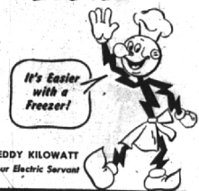
REDDY KILOWATT Your Electric Servant