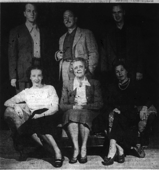
Members of the Village Players cast of "Another Part of the Forest", the Hellman drama which will be presented on April 29 and 30 and again on May 6 and 7, pose for the camera on the stage of the playhouse on Chestnut street.