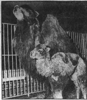
The proud, upraised head of Ely, a Bactrian camel at New York's Central Park Zoo, seems to indicate that she thinks her brand-new offspring, Pat, is worth walking a mile for any day. The 75-pound baby camel is a bit shy for his camera debut.