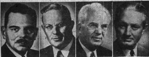
For President THOMAS E. DEWEY For Vice President EARL WARREN For U. S. Senator HOMER FERGUSON For Governor KIM SIGLER

The Nation's big jobs have tried, tested and proven these men. The records show it—they're BIG men for BIG jobs—men you can depend on for honest, progressive, efficient government, run to benefit you and your family. They preach and practice unity of purpose to accomplish a program of freedom, peace and plenty—Vote for BIG men! Vote Republican!