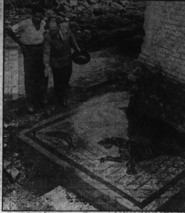
This Italian peasant, left, swears he didn't know what he was doing, but an inspector of the Ministry of Culture points out that his ditch-digging in Rome was most valuable. This mosaic that the worker uncovered dates back to the Second Century A. D. and is believed to be the floor of a Roman villa.