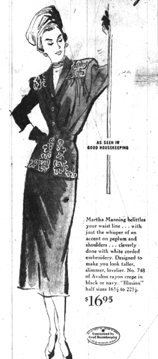
AS SEEN IN GOOD HOUSEKEEPING

Martha Manning belittles your waist line . . . with just the whisper of an accent on puffed and shouleders . . . cleverly done with white corded embroidery. Designed to make you look taller, slimmer, lovelier. No. 748 of Avalon rayon crepe in black or navy. "Illinois" half sizes 16 1/2 to 22 1/2. $16.95