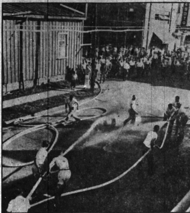
Mebane, N. C. firemen have added their own form of "water polo" to checkers, traditional freestyle pastime. Teams with fire hoses try to drive an empty oil drum across the opposing goal-line—and both players and spectators get a soaking, as seen above.