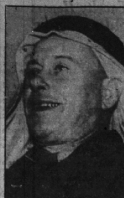
Fawzi el Kawakji is commander of the Arab "Liberation Army," made up mostly of Syrian volunteers. He is shown addressing his command at Kabatia, near Nabulus, Palestine.