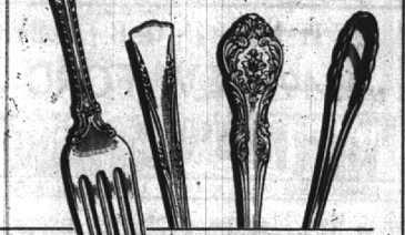
GORHAM ENGLISH GARDEN, GORHAM GREENGLASS, GORHAM KING EDWARD, GORHAM LENS

65 open stock patterns by such famous silversmiths as Gorham, Heirloom, International, Lunt, Reed and Barton, Smith, Wallace and Whiting. Sold by the individual piece, in place settings, or in complete sets of 6-8-12.