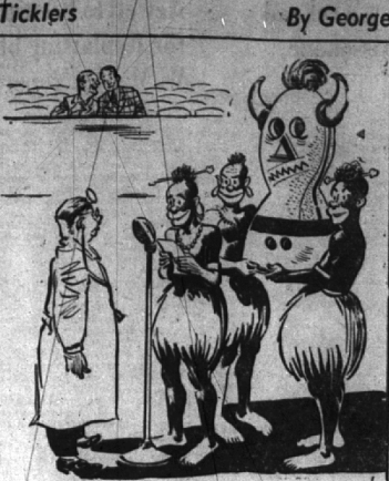
"The doctor is getting another degree from some place in Africa."

MISCELLANEOUS PLASTERING NEW and repair. Phone 3617.