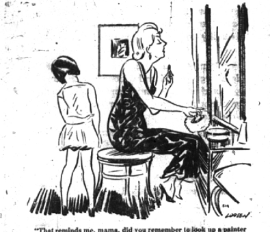
"That reminds me, mama, did you remember to look up a painter and decorator in the telephone directory Yellow Pages?"